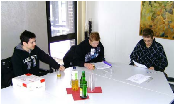
Figure 4: Discussion in small groups.