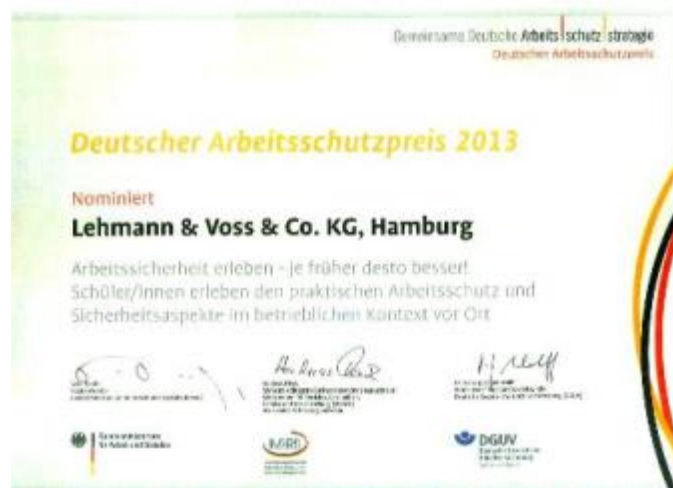
Figure 6: Certificate for the German Occupational Safety and Health Award 2013.