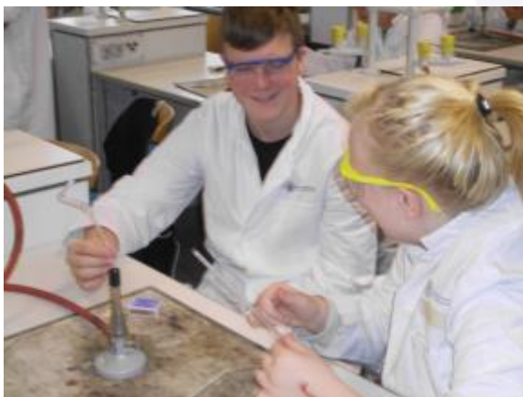
Figure 2: Pupils learning basic rules for using a Bunsen burner.