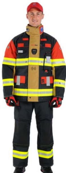
An example of a smart firefighter's garment

Good PPE is PPE that is used! It follows that smart PPE has to be accepted by the user. Otherwise, the probability that it will not be worn is high, and protection will be removed instead of enhanced. Manufacturers as well as purchasers should have a good understanding of what future users really need and in particular which kinds of smart functions will be accepted.