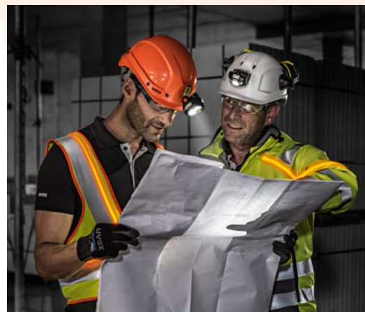
An example of visibility clothing with active lighting, © UVEX

Of course, this gap in the standardisation of smart PPE will be closed. However, this will take some time. In addition, standardisation bodies are starting to recognise that smart PPE products are a completely new type of product. Members of standardisation groups are faced with the same challenge as manufacturers and notified bodies: first, they have to learn about the new technology. One example is the German standardisation project on visibility clothing with active lighting. Since the beginning of 2018, manufacturers, suppliers, notified bodies, users and OSH experts have been working on a technical specification containing health and safety requirements for traditional high-visibility clothing combined with illuminating elements (e.g. light-emitting diodes). Although this product is not strictly smart PPE — there is no interaction with the environment, as the light is switched on by hand — the challenges mentioned above are present all the same. The electrical part of the standard is completely new to textile experts. The publication of this document is expected by the end of 2020.