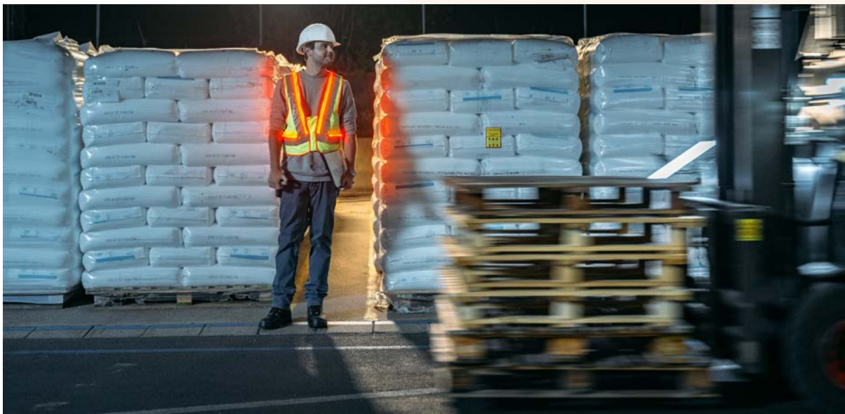
An example of collision warning equipment, © Linde Material Handling GmbH

At A+A 2019 — the world's leading trade fair for health and safety at work — only a few out of more than 2,000 exhibitors displayed smart PPE. This may be an indication of the extent of the abovementioned challenges. Some of them were garments with active lighting. One solution integrates a sensor into an active lighting vest that warns the wearer if a mobile machine, equipped with the corresponding sensor, comes too close. The sensor vibrates and generates sound and the lights start flashing. On the machine, similar warning signs appear; it is even possible to use the equipment to control the speed of the machine to avoid collision with the person detected.