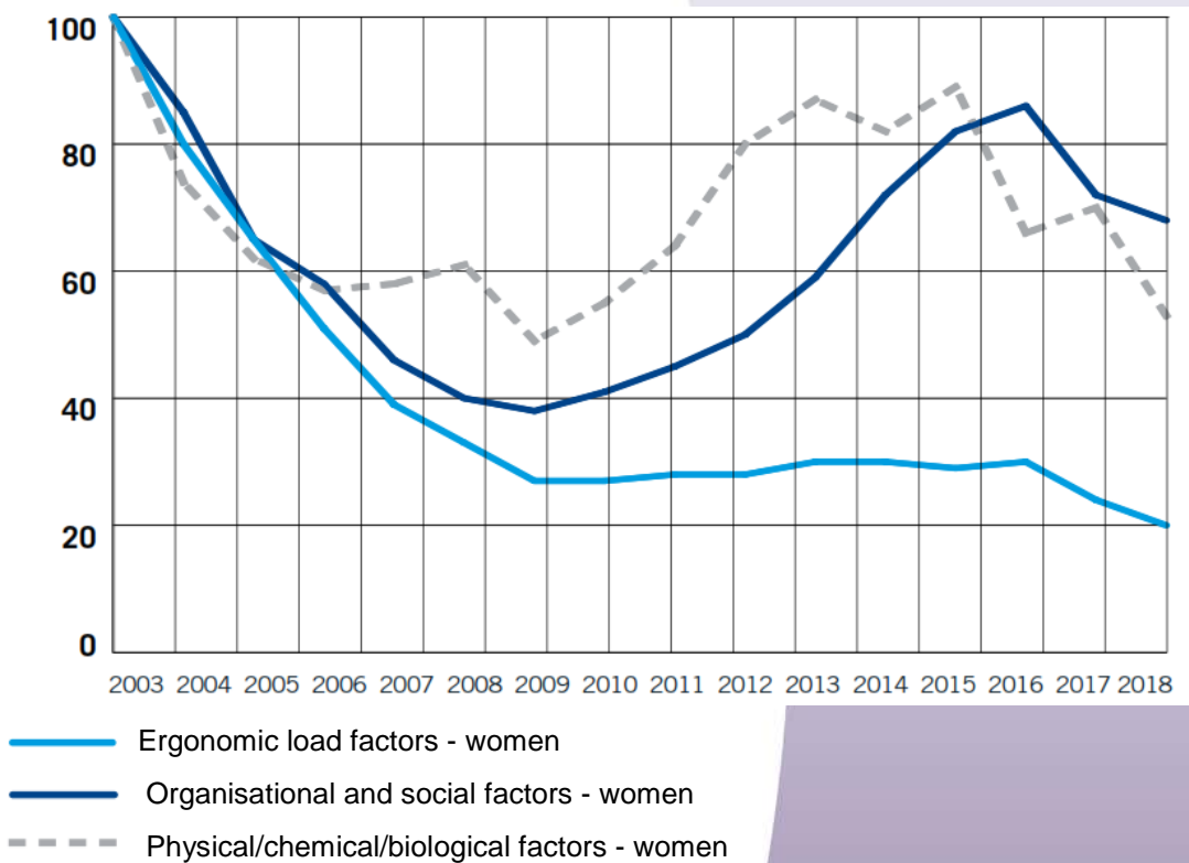
Figure 2a. Trends in the main factors to which occupational illnesses are attributed, relative to 2003 (100) for women.