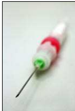
Figure 1. Injuries from needles can be serious and even lethal

Considering these statistics, excellent occupational medical care of workers including preventive check-ups, vaccinations, etc., should be standard, as well as the registration of each NSI as an accident at work. During vocational training the staff should be shown safe working practices (no recapping) and special containers should be provided for used needles.