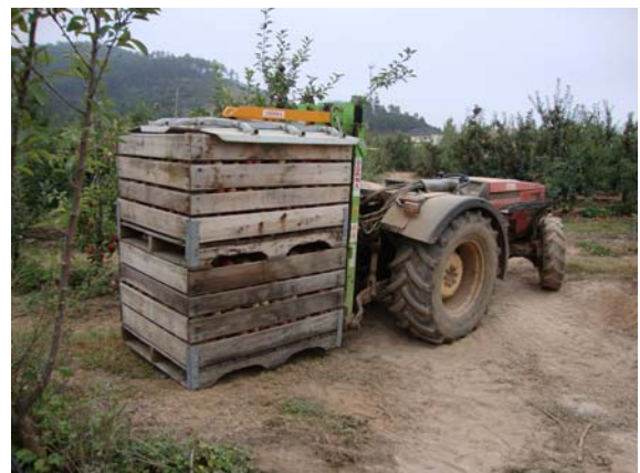
Open top containers are used in the fruit collection process