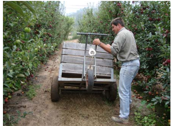
Procedures to unload and load the manually pulled chariots