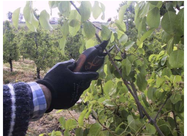
Portable electric scissors to trim the trees

The second solution presented is a higher investment solution , with high efficiency in the collection of fruits and in the transportation of fruits to the pallets. Also the trunk and shoulder postures of the employees during fruit collection are controlled by the height of the standing platforms and by the height of the fruits belt conveyors.