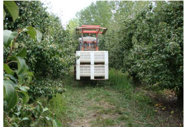
Preparation of the land in a way that improves access by the transport