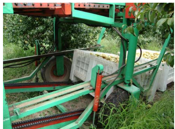
A semi-automatic processes to collect and transport the fruits to the pallets