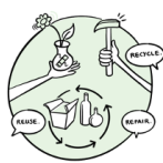
Illustration showing an overview of the four scenarios

The European Agency for Safety and Health at Work (EU-OSHA) has for several years been applying foresight approaches as part of its mission to contribute to safer and healthier working conditions in the EU. Its foresight approach looks at changes that may take place in the future and considers what their consequences could be for occupational safety and health (OSH), with the aim of supporting policymaking and raising awareness to reduce work-related accidents and ill health and improve safe and healthy working environments. Within its third foresight cycle, work is focused on the CE 1 and its effects on OSH, primarily within the European context. In phase 1 of the project, four macro-scenarios focused on the CE and its effects on OSH up to 2040 were developed, drawing strongly from previous foresight work undertaken by EU-OSHA. As a set, they represent a range of different possible outcomes for future working conditions in the EU as a result of a CE and were used to encourage dialogue and reflection about future possibilities at a series of stakeholder workshops held in 2022.