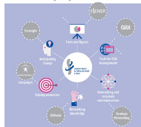
EU-OSHA Priority areas and activities Multi-annual Strategic Programme 2014-2020