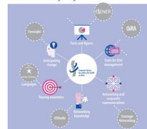
EU-OSHA Priority areas and activities Multi-annual Strategic Programme 2014-2020