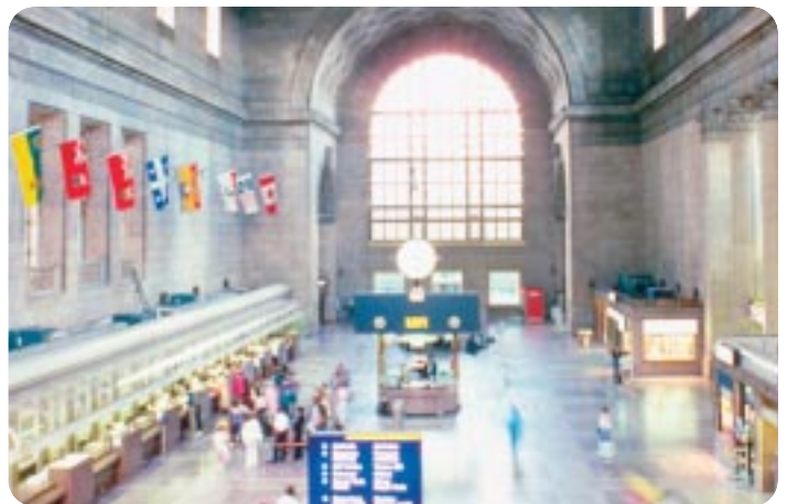
Pearson International Airport ( above ) and Union Station ( below )